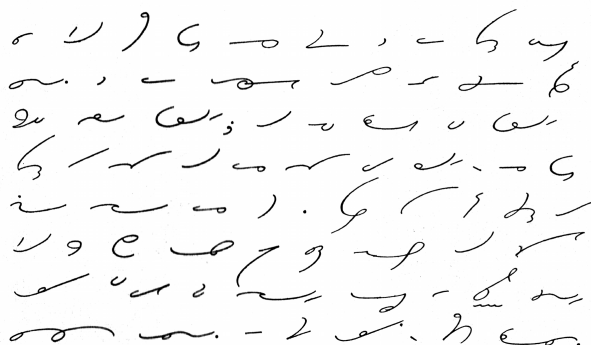
Figure 1: Gregg shorthand sample 3

or stylus) and physical (i.e. pen and paper, captured through photographs or scans) input methods into digitally encoded text.